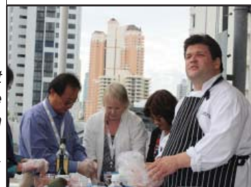
Below: Conference attendees gained an insight into some cooking ideas