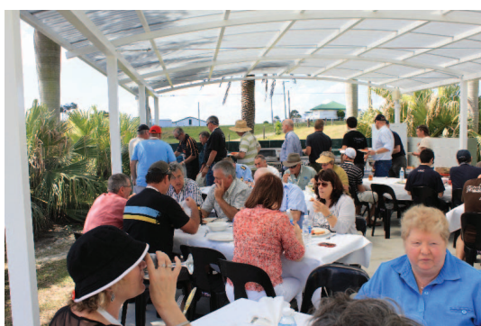
Delegates from Seafood Directions enjoying lunch at Gold Coast Marine Aquaculture – Sunday October 23, 2011 tour