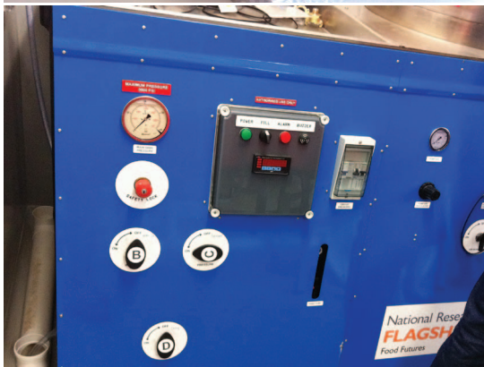
Above: The R & D committee will appreciate these photos– yes it's the TARDIS...the Triploid compression chamber.