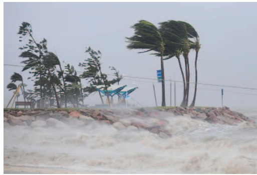
Above: Cyclone Yasi hits with a vengeance....